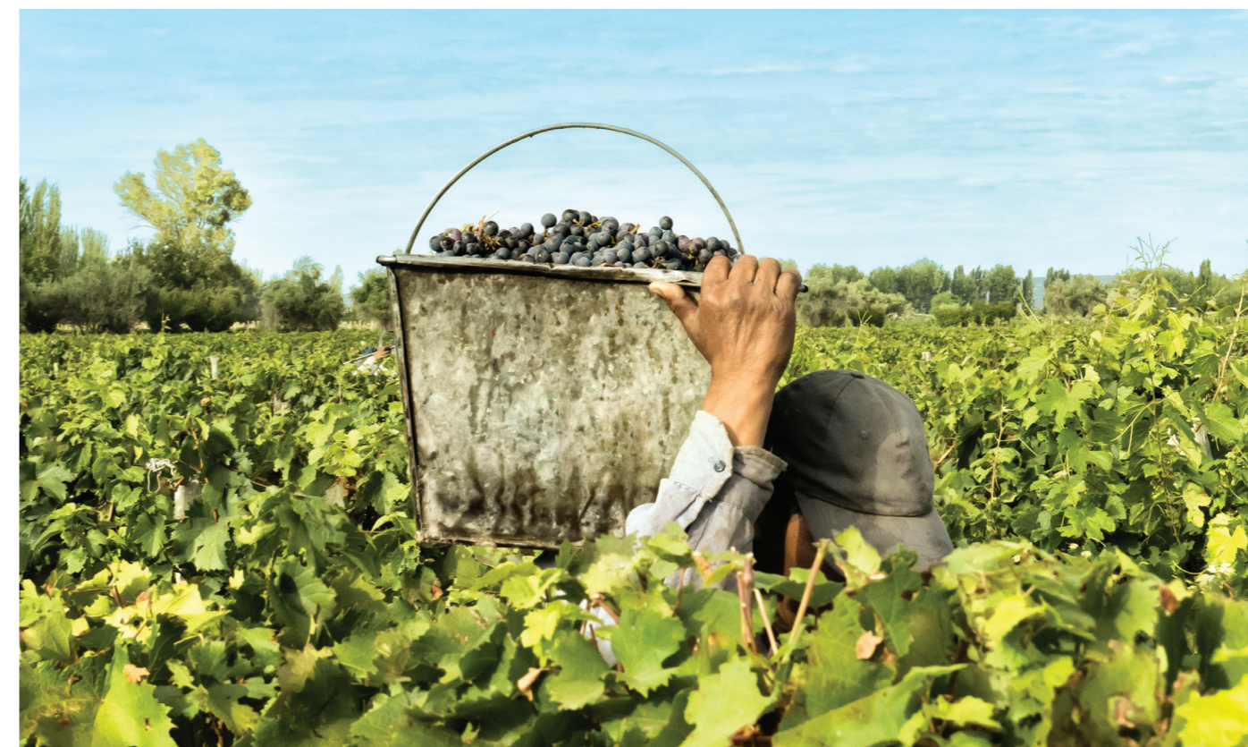
Trade Finance helps producers across the world get their goods to market

Whilst we believe that contributing to sustainable development goes well beyond Corporate Social Responsibility (CSR) initiatives, we view CSR activities aligned with our business goals as one part of that wider contribution. Many of our CSR activities have been aligned with the priorities of our local community, in particular through an initiative run by London's Lord Mayor in partnership