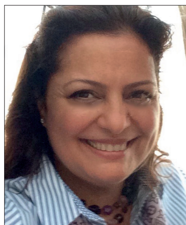
Sandra Anani Sustainability to Action

His current work involves projects on environmental-economic accounting and sustainability measurement within the United Nations system, the Natural Capital Coalition and various companies and governments. Carl is a leading player in closing the gap between government and corporate approaches to natural capital accounting.