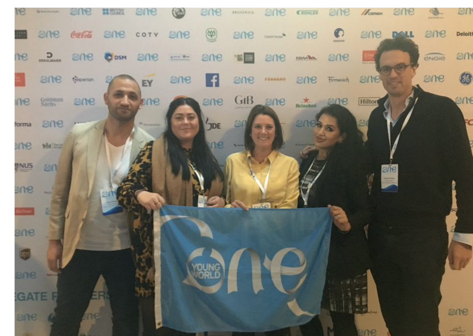
Several colleagues attended the One Young World summit in The Hague